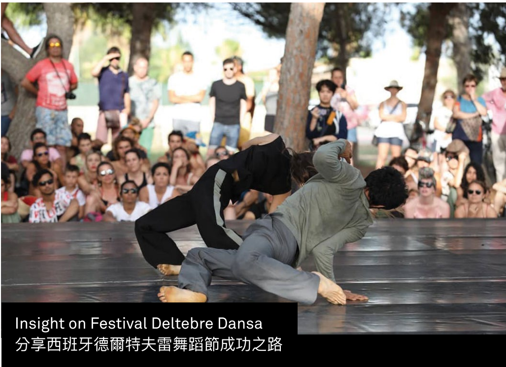
Insight on Festival Deltebre Dansa 分享西班牙德爾特夫雷舞蹈節成功之路

8.1.2020 WED 6:00pm - 7:30pm Dance Studio 1 1號舞蹈室