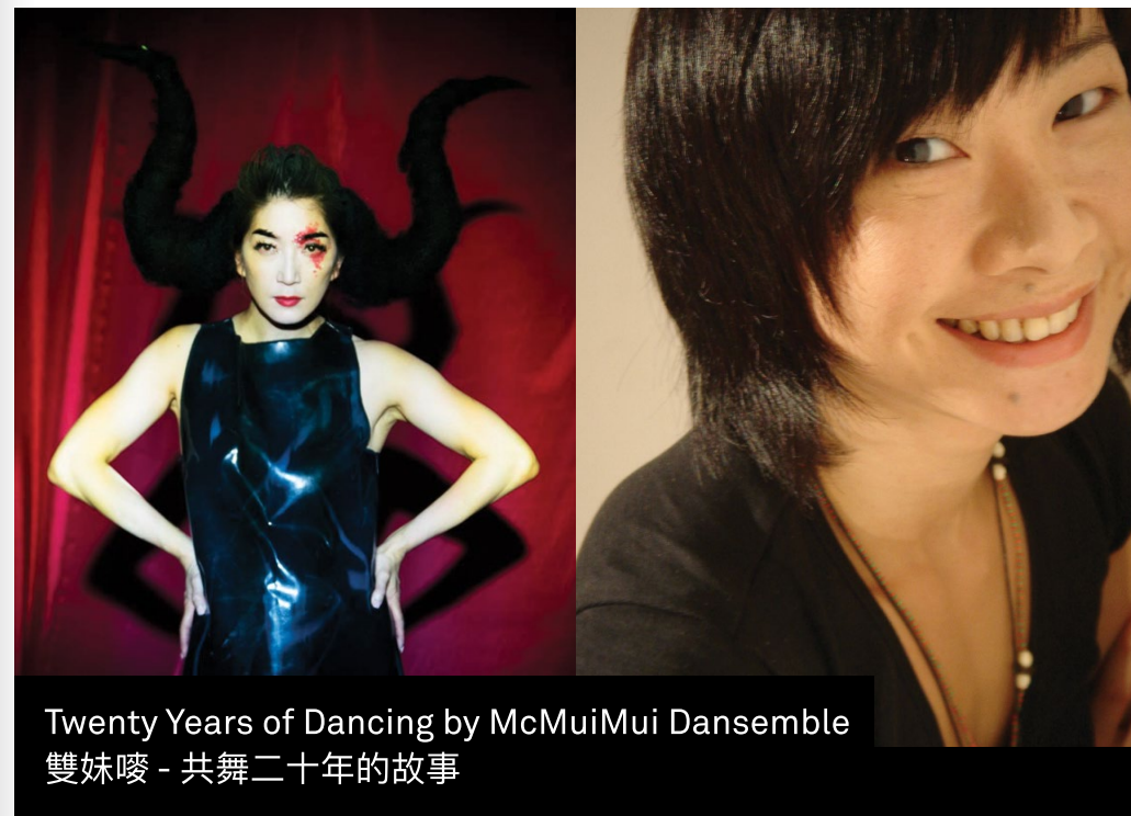
Twenty Years of Dancing by McMuiMui Dansemble 雙妹嘜 - 共舞二十年的故事

16.09.2019 MON 6:00pm – 7:30pm Dance Studio 1 1 號舞蹈室